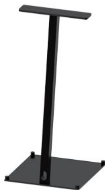
Stand for two-hand operation console, with cable cut-outs for metric screw connections