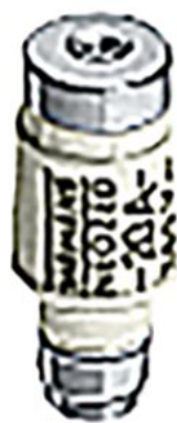
NEOZED fuse-link, D02, 32 A, gG, Un AC: 400 V, Un DC: 250 V, with tin-coated contact-caps