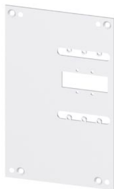
rear interlock mounting plate accessory for: 3VA1 160