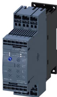
SIRIUS soft starter S0 32 A, 15 kW/400 V, 40 °C 200-480 V AC, 24 V AC/DC spring-type terminals