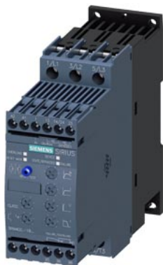
SIRIUS soft starter S0 32 A, 15 kW/400 V, 40 °C 200-480 V AC, 110-230 V AC/DC Screw terminals