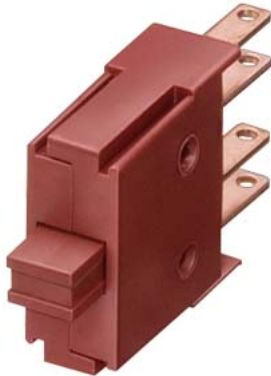
Contact block, 1 NC, flat connector terminal