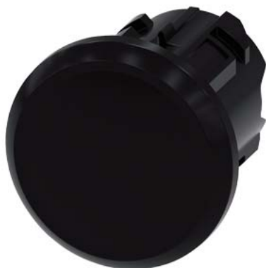
Sealing plug for unused round control points, 22 mm, plastic, black