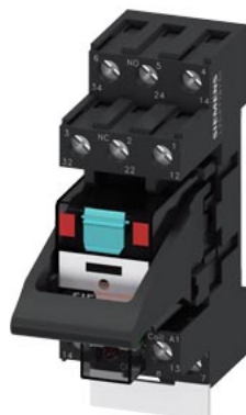
Plug-in relay complete unit 3 W, 230 V AC LED module red Standard plug-in socket screw terminal 3.5 mm pinning