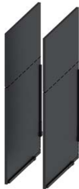
phase barriers 2 units accessory for: 3VA1 100/160