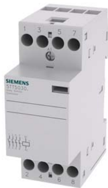
INSTA contactor with 4 NO contacts Contact for 230 V AC, 400 V 25 A Control 230 V AC