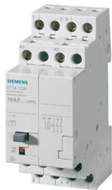
Remote control switch with 3 NO contacts Contact for 230 V AC, 400V 16A Control 230 V AC