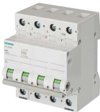
off switch 63A 3-pole+N