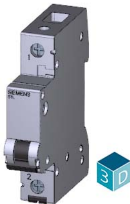
off switch 63A 1-pole