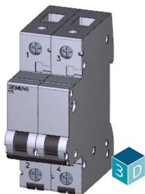
off switch 32A 2-pole