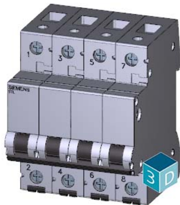
off switch 125A 4-pole