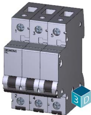
off switch 100A 3-pole