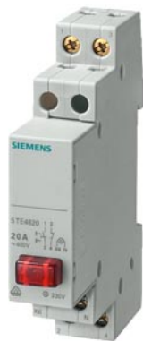
button, 1 NO/1 NC 20 A 1 key red, Lamp 230 V