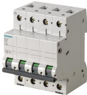
Miniature circuit breaker 400 V 6kA, 4-pole, C, 63 A