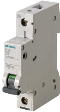
Miniature circuit breaker 230/400 V 6kA, 1-pole, B, 50 A