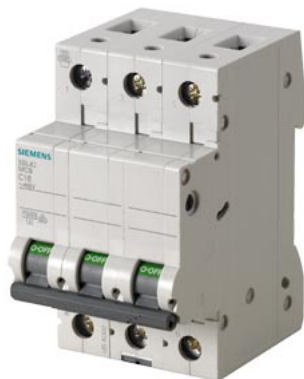
Miniature circuit breaker 400 V 10kA, 3-pole, B, 20 A