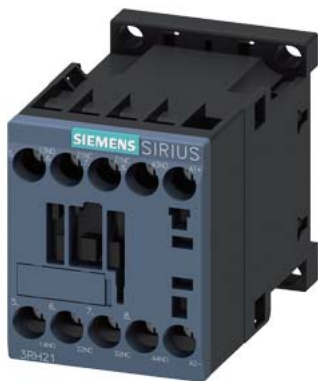
Contactor relay, 2 NO + 2 NC, 24 V DC, Size S00, screw terminal